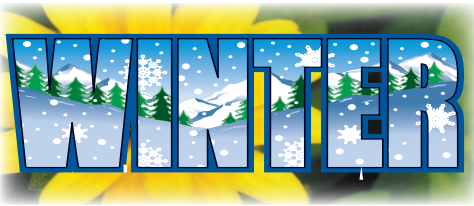
Isanti City Flower: Rudbeckia