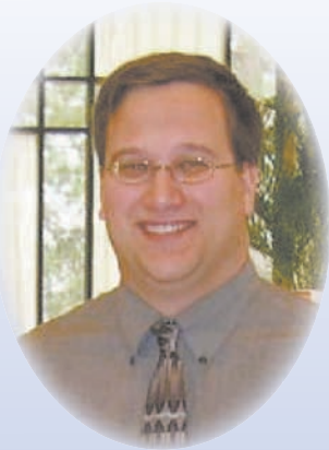
Mayor George A. Wimmer