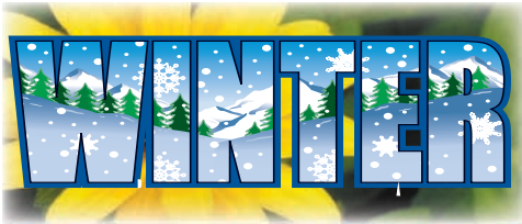
Isanti City Flower: Rudbeckia

PRSRT STD US POSTAGE PAID ISANTI, MN 55040 PERMIT NO. 22