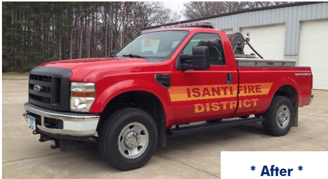
* After *

Isanti Fire has recently taken possession of new communications equipment awarded by applying for a grant with the Federal Emergency Management Agency (FEMA).