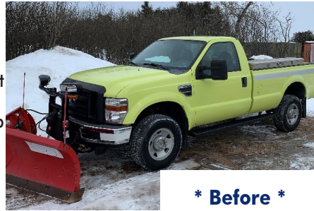
* Before *

Our grass fire truck project is complete! The truck started life as a Department of Natural Resources truck and was purchased by us with budget money, grant funds from the DNR and a donation from the Firefighters Rodeo Association. The truck is currently responding out of our Station 2 on our western side. Thank you to the Firefighters that donated their time and expertise to help complete this project!