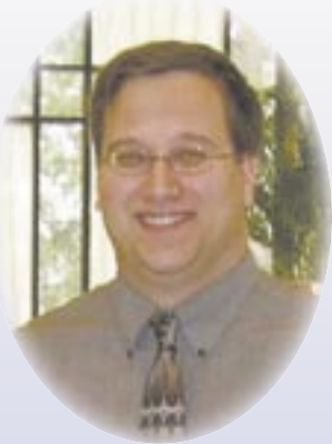
Mayor George A. Wimmer