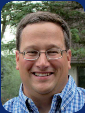
Mayor George A. Wimmer