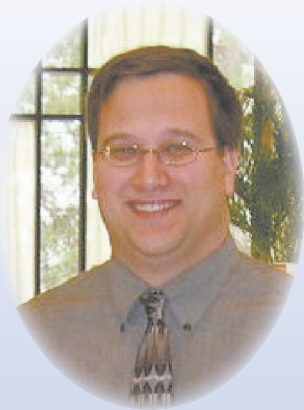
Mayor George A. Wimmer