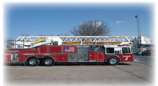
Isanti Fire's 102 Foot Aerial Platform

For more information on our Rodeo, ISO and other Fire Department updates, please visit isantifiredistrict.org .