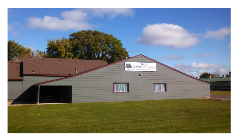
AVAILABILITY, PRICING, AND APPLICATIONS ONLINE AT CITYOFISANTI.US