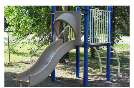
VFW Park Palomino Rd SE & Railroad Ave SE (1 acre)