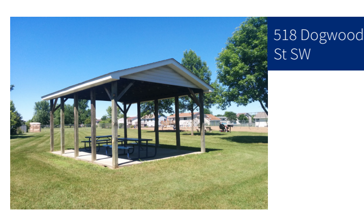
Isanti Hills Neighborhood Park

PAVILION RESERVATIONS AVAILABLE APRIL - OCTOBER FREE TO CITY OF ISANTI RESIDENTS; $10 FOR NON-RESIDENTS* CONTACT 763-762-5754 FOR MORE INFORMATION