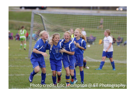
Home of C-I Soccer Club 950 - 3rd Ave NW