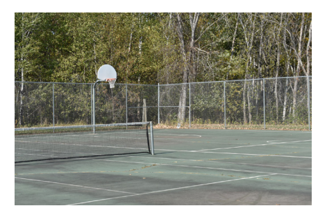
Whisper Ridge Park 795 - 3rd Ave SW (11 acres)