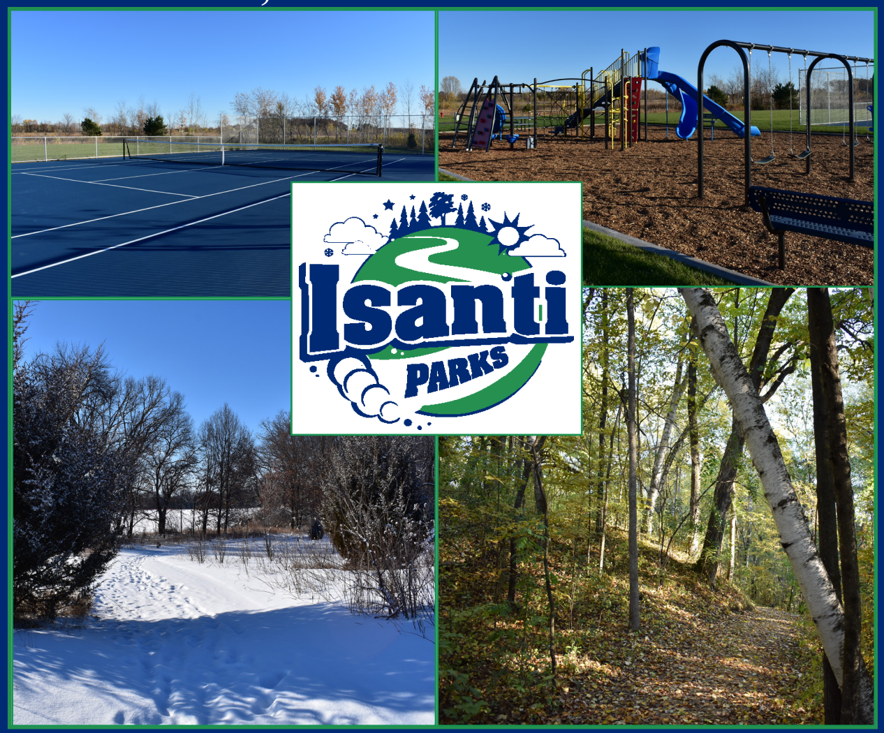
Get out and explore...