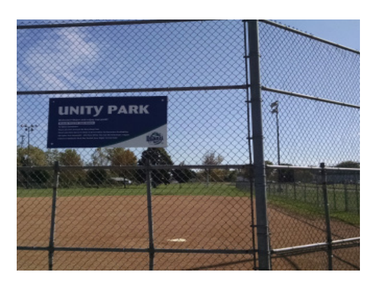
Unity Park Softball Field 420 - 3rd Ave NW