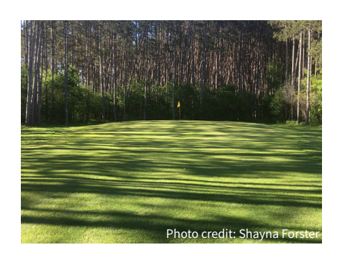
Sanbrook Golf Course 1261 Heritage Blvd NE