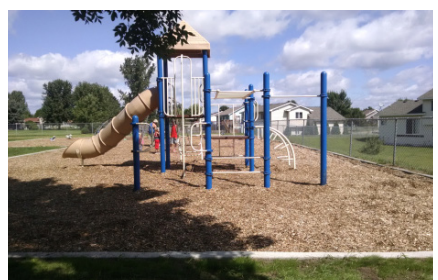
Isanti Hills Neighborhood Park 518 Dogwood St SW (1 acre)