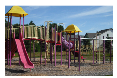
Riverside Park 503 Rum River Drive NW (4 acres)