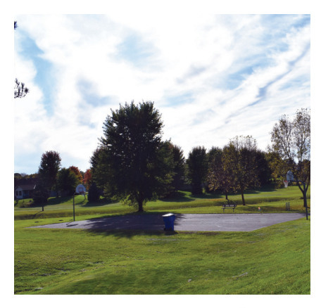
Mattson Park Tennis Court & Basketball Court 311 - 5th Ave NW