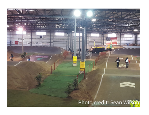
Isanti Indoor Arena Home of Rum River BMX 101 Isanti Parkway NW