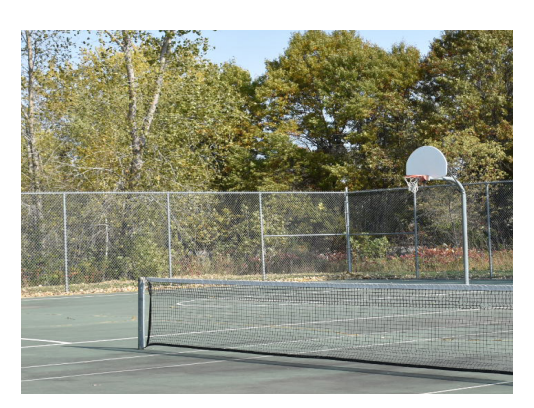
Whisper Ridge Park Tennis Court & Basketball Court 795 - 3rd Ave SW