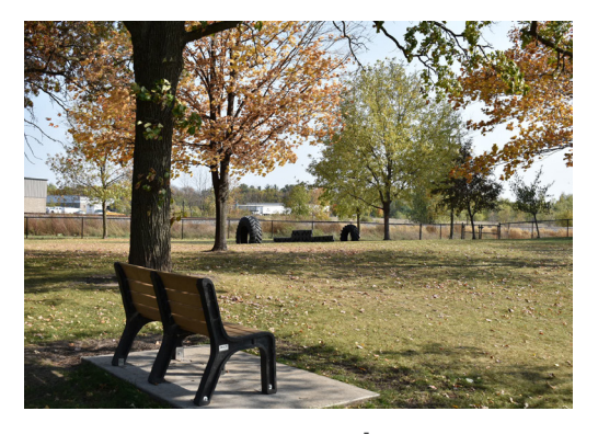
Dog Park 201 Isanti Parkway NW East of Isanti Indoor Arena