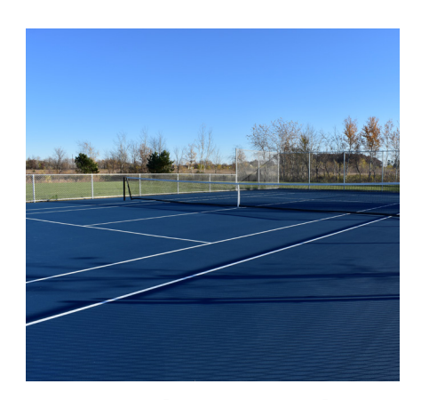
Academy Park Tennis Court 901 - 6th Ave Ct NE