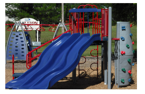
Mattson Park 311 - 5th Ave NW (7 acres)