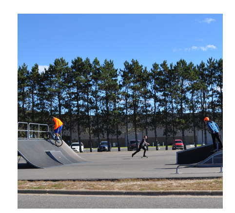
Bluebird Park Outdoor Pleasure Rink, Skate Park, Basketball Court 201 Isanti Pkwy NW