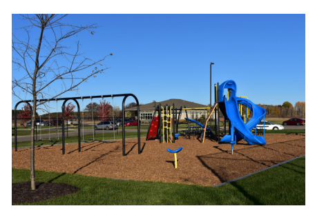
Academy Park 901 - 6th Ave Ct (1.5 acres)